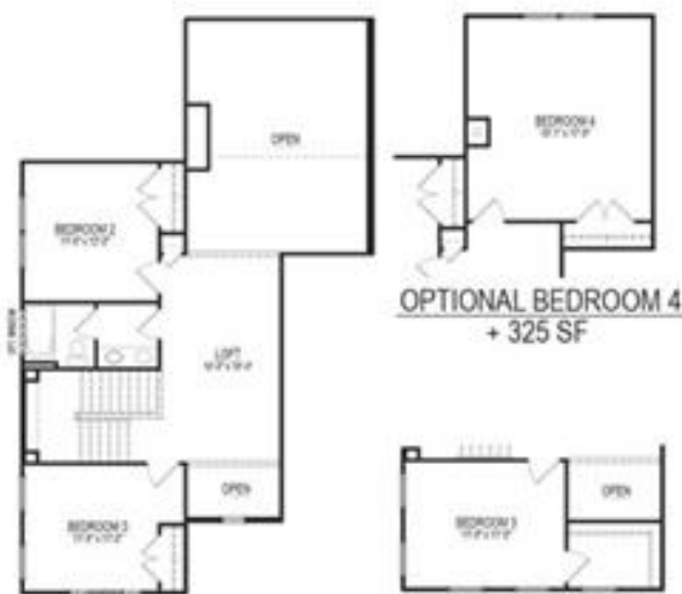
OPTIONAL BEDROOM 4 + 325 SF